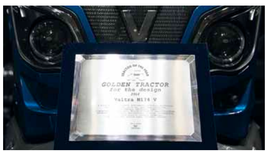
The Valtra N Series claims two awards at Agritechnica: Machine of the Year 2016 and Golden Tractor for Design 2016.