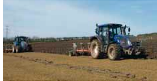
▲▲ Tim's recently delivered T154. All tractors are fitted with front linkage and most have front PTO. A new T714 arrives soon.