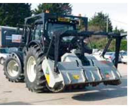
The T203 with TwinTrac and forest protection spends much of the time working with a heavy-duty mulcher maintaining way-

When asked why he chose Valtra, John Paul is quite clear: "They have a good clean underside, nothing to get snagged up in out of the way places. They are well built and comfortable, so the drivers like them. They also have good, reliable engines with an excellent pedigree."