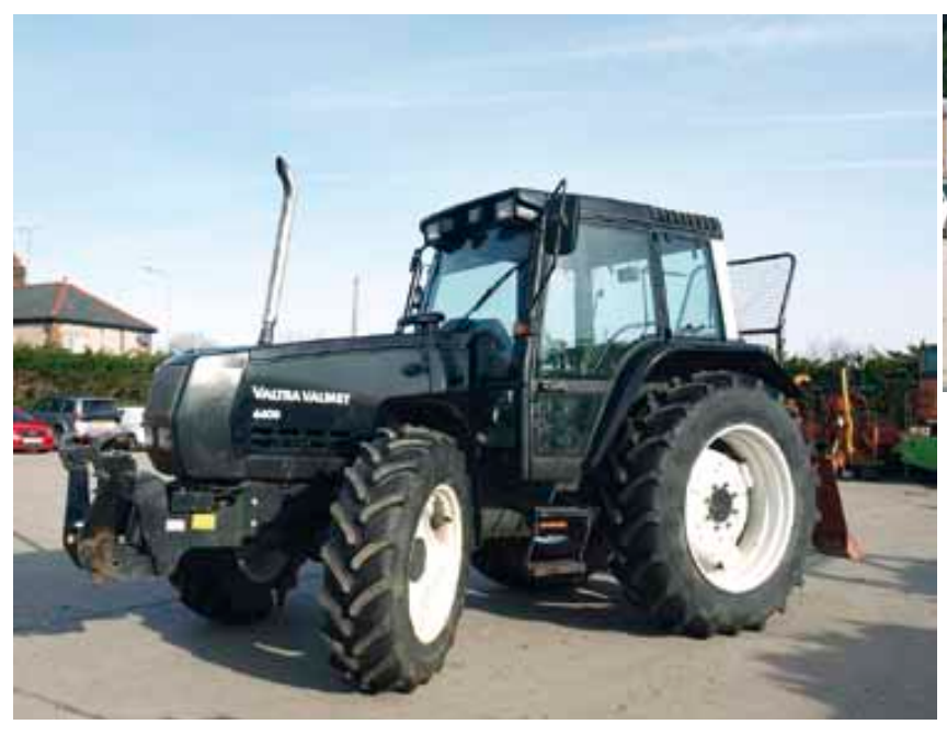
The 100-horsepower 6400 is used for winching and trailer transport.

"With the help of a friend and partner we're looking at the expanding wood chip and combined heat and power businesses. We have access to the raw products for both operations, and the power could be used here on site in the workshop and office or sold into the grid, while the heat could be used to dry wood chips. It all dovetails nicely into our established business."