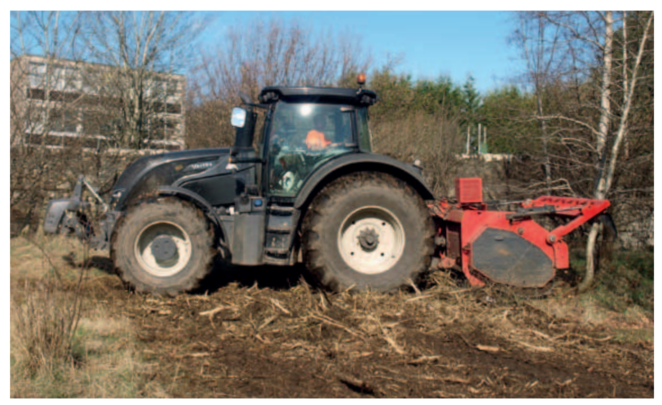
The Ahwi FM900 is one of the heaviest mulchers available. It is positive to handle – does not jump up and down – and managing it with the hydraulics on the S374 is simple.