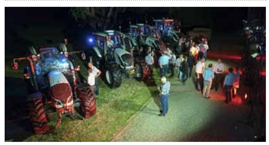
The launch of Valtra's latest models was instructive and inspiring. After the evening programme the guests rushed to inspect the new tractors up close.