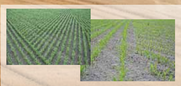
Section Control can be used together with AutoGuide to help you maximise your yield without wasting any space also at headlands.