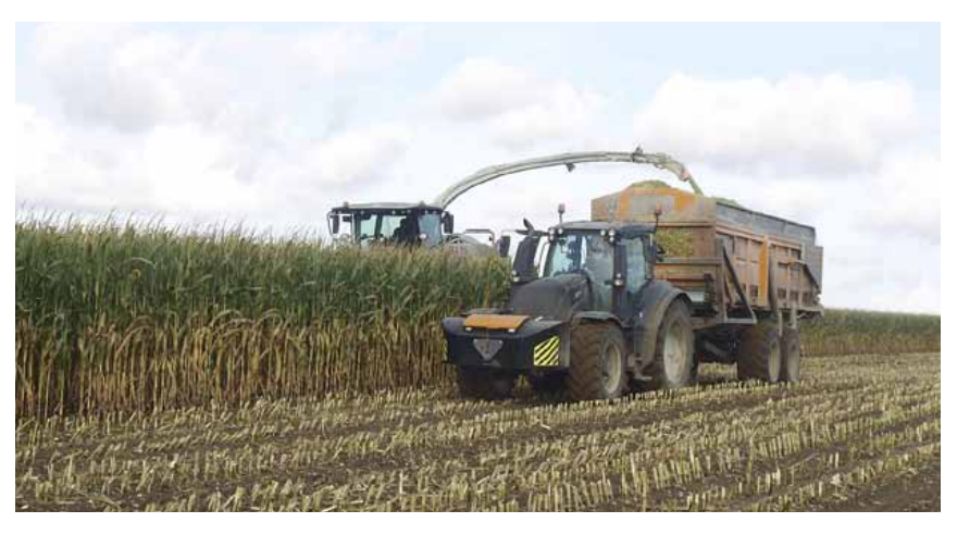
One of the Valtra collects a load of Maize for transfer to an artic truck.

Will grows and harvests over 1,000 acres or rye and 6,500 acres of maize for silage which is then fed into the digesters.