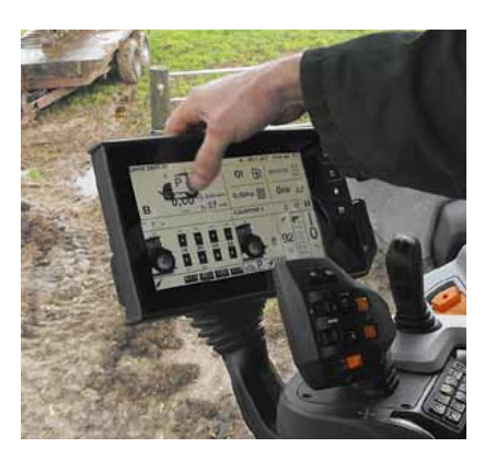
Mr. Brendon was particularly impressed with how easy it was to use the SmartTouch terminal – 'It felt completely natural, no matter what function you are after it is only a couple of taps away.'

chasing decision having driven previous '2' and '3' series Valtra machines had this to say about the new T214. "The first thing you notice about this 4th generation model is the driver comfort, which is exceptional", Matthew states. "We've always had Valtras here, but the T214 is a step above." Asked to highlight the most noticeable differences, he lists: "The higher road speed of 57 kmh plus the Evolution seat, and excellent suspension allows a very comfortable ride with a machine that is specified to run at high speed without drinking too much fuel."