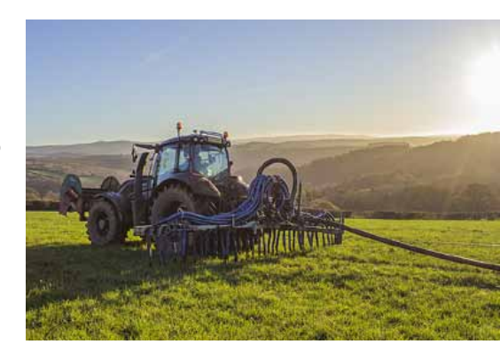
Umbilical slurry spreading will keep the T214D busy for many a day as one of its major tasks within the operations at B & B.

"I feel like Valtra have finally made a real agricultural tractor," concludes Mr. Brendon. "Previous models have had lots of advantages but there was always this hangover from its forestry background, especially with the layout of the controls made to be accessible also for reverse drive. The '4' series meant they were halfway there but the SmartTouch has completed the package!" •