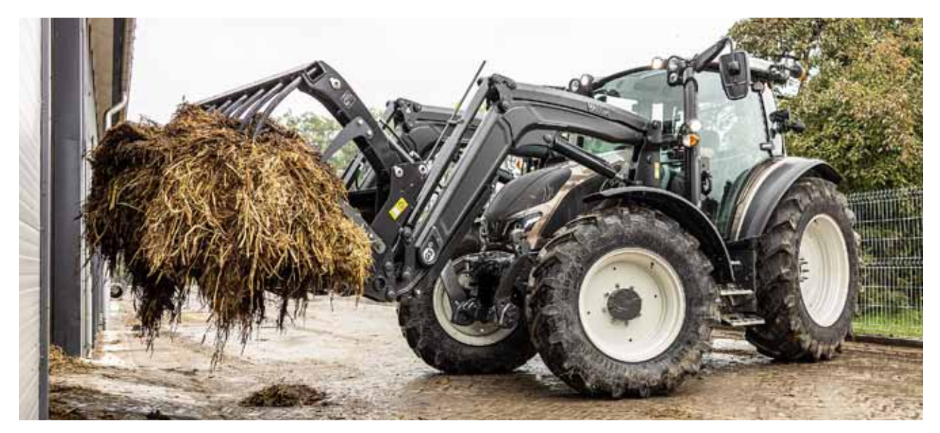
The G Series weighs 5140 kg. The light weight, compact size and agile performances makes it ideal for farm tasks. The maximum total weight is 9500 kg.