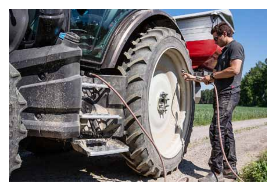
The new G Series Is available with a compressed air connector on the side of the tractor by the cab steps, making It easy to adjust tyre pressures, for example.

The impressive features on the G Series make it equally suitable for contracting, such as municipal tasks and road maintenance. A powerful front linkage with a lifting capacity of 3 tonnes and PTO are available at the front.