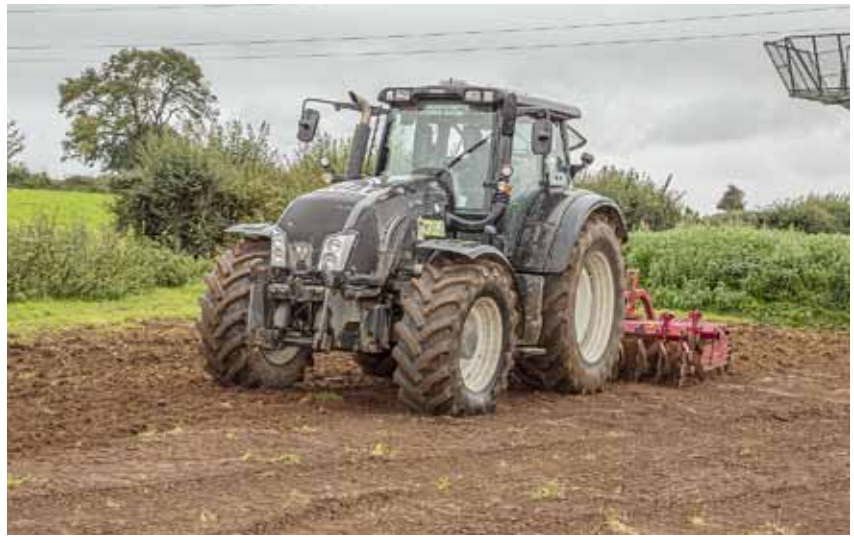
Seedbed preparation gets underway, ahead of re-seeding with grass and wild flower mixes.

"And it's what has kept me with the brand. I have no set replacement policy, we run our tractors as long as they remain reliable."