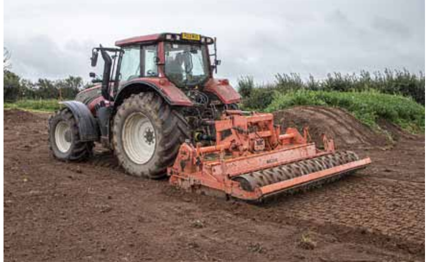
Land reinstatement after civil engineering and utility projects calls for a flexible approach with available tractor power and implements.