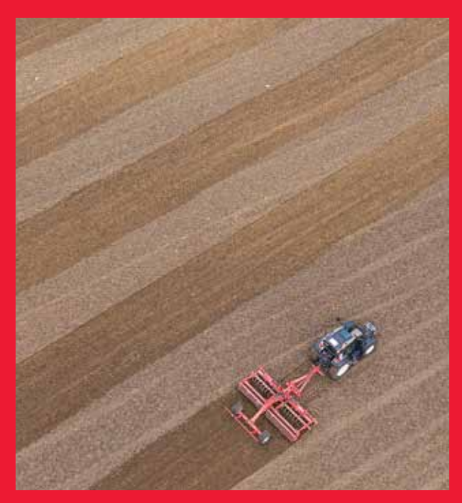
The new Wayline Assistant features makes it possible to store multiple crisscrossing waylines for a single field section, for example following the edges of the field.

G Series Versu models get the same precision farming features as on bigger tractors, including Valtra Guide automated steering, Section Control, Variable Rate Control, Task Doc and the U-Pilot headland management system. Operating the G Series has been kept simple thanks to the awardwinning SmartTouch user interface, which allows the user to programme the tractor's functions very precisely according to individual preferences, adding to the premium user experience. Similarly, if the tractor is used by more than one driver, individual preferences are easy to set and recall every time a new driver enters the cab. •