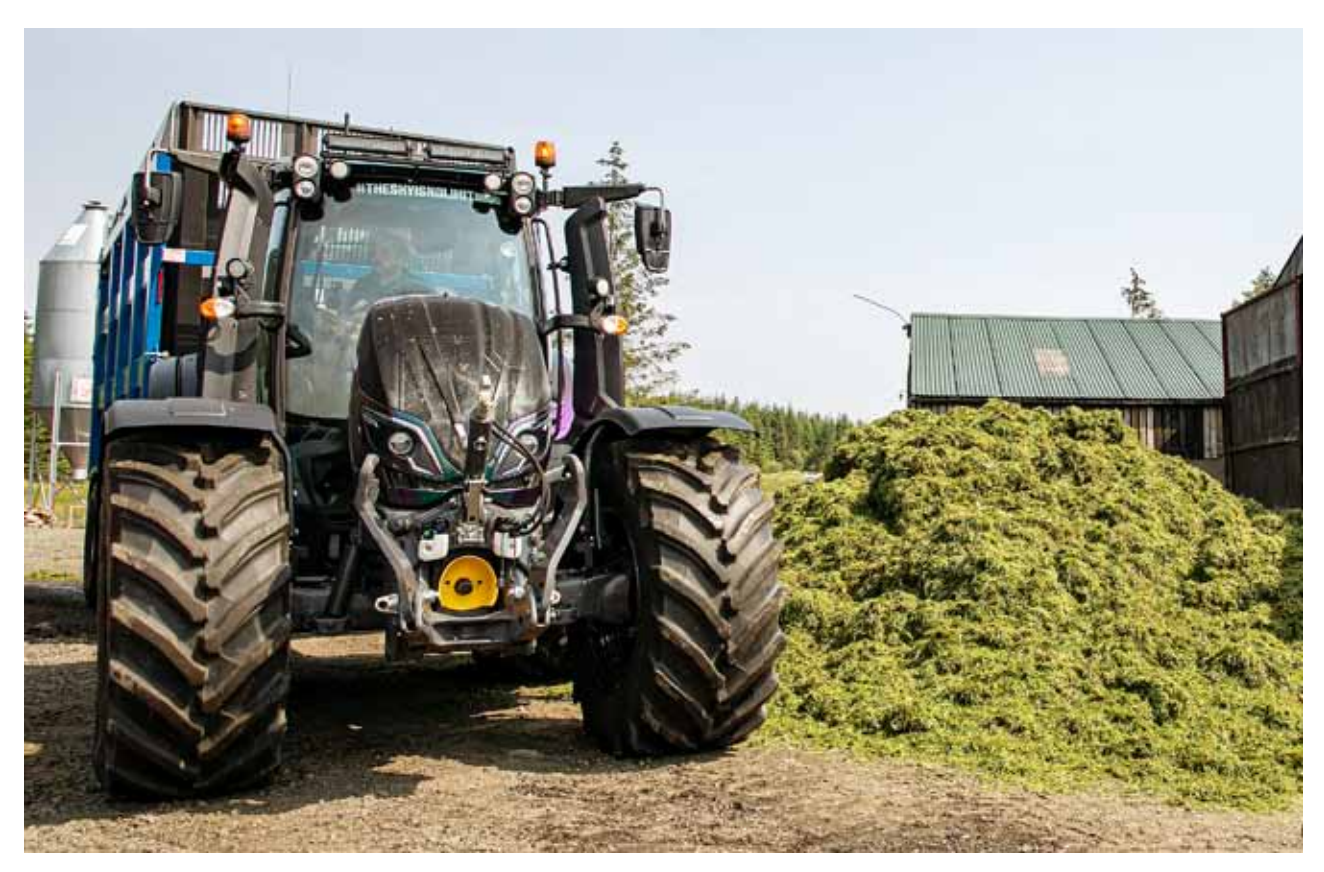
Charity Valtra T234 Direct.