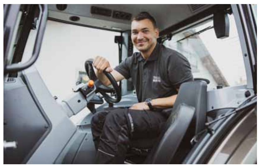
Valtra wants to offer its customers the best tractor user experience in the industry. This encompasses not only the tractor, but also all related services.