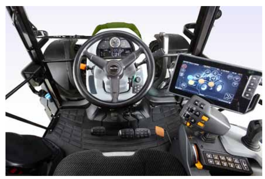
Go, Look, Drive. The new G Series is extremely easy to get acquainted with and begin using. Access to the spacious cab is easy, and the simple-to-use controls are ergonomically positioned.

The G Series is also available with Valtra's traditional forestry features. For forestry tasks, the G Series can be specified with narrow mudguards, forest tyres, a steel 170-litre fuel tank, polycarbonate glass, a rotating seat and cab protection that can also be used to fit auxiliary lights.